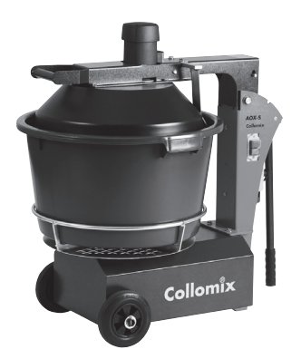
The AOX when closed