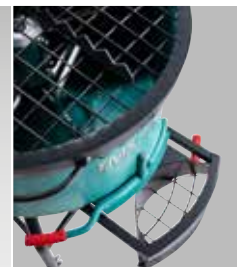
· Vibrating mechanics ·