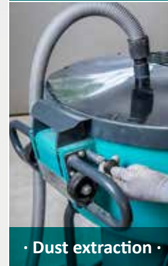
· Dust extraction ·