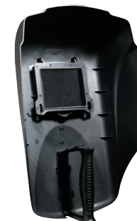
B100F 110 x 90