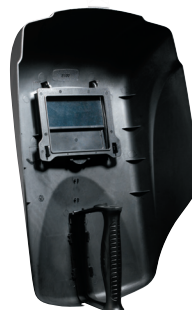
B100F 105 x 50