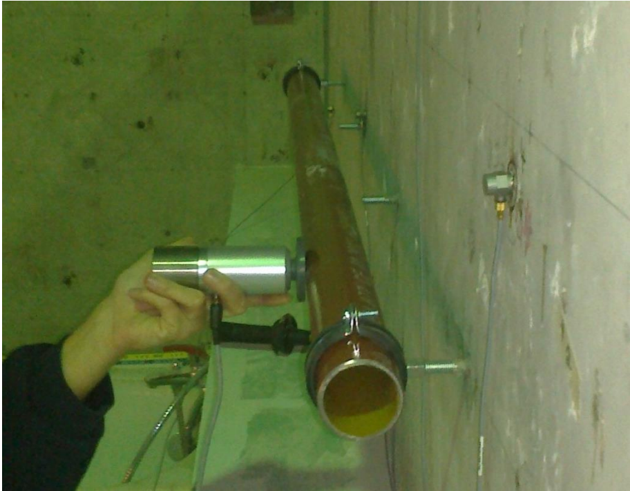
Figure 1: Experimental set-up for determination of the insertion loss: 4" cast iron pipe connected to the reception plate test rig with fischer pipe clamps; excitation of the pipe with a miniature tapping machine