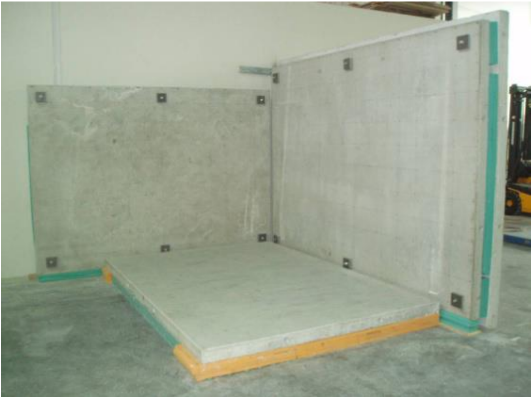
Figure 2: Reception plate test rig at the Hochschule für Technik Stuttgart