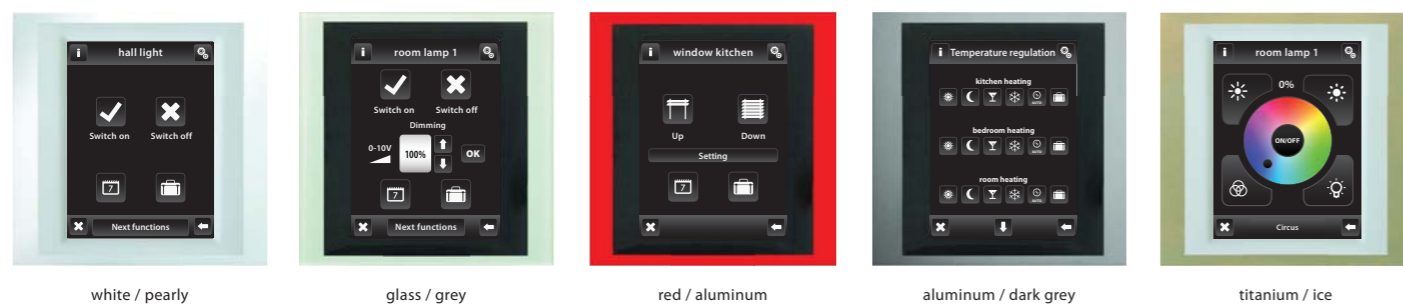
white / pearly

** Weight includes the plastic frame and the intermediate frame.