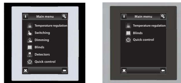
black / white