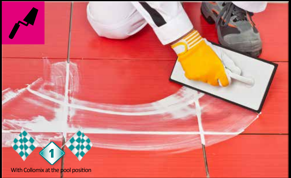
With Collomix at the pool position